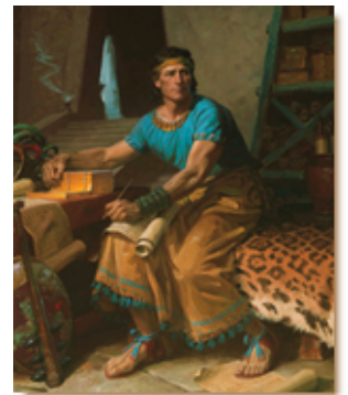
Mormon Abridging the Plates

Words of Mormon 1:2, 8; see also the title page of the Book of Mormon Mormon said the purpose of the entire sacred record he was abridging was to bring people to a knowledge of God and the redemption of Christ.