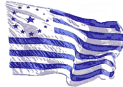
The Church Flag

Isaiah prophesied that the Lord would "lift up an ensign to the nations". An ensign is a banner or flag; a standard-bearer.