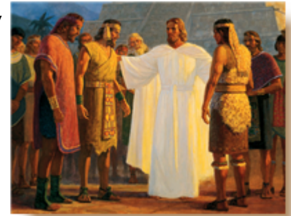
Christ with Three Nephite Disciples Gary L. Kapp

scriptures, setting a righteous example by personally studying the scriptures, and using examples from the scriptures to teach principles necessary for successful daily living.