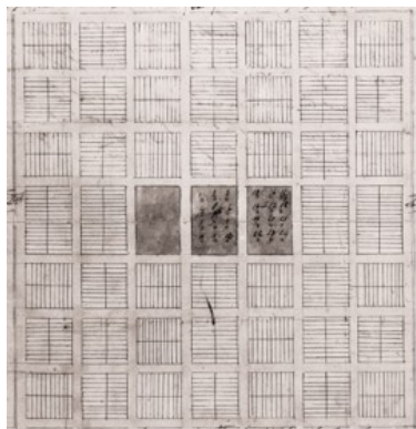
Plat for the City of Zion. The site for the temple is in the center.

In late June 1833, the Prophet Joseph Smith sent a plat for the construction of the city of Zion to the Saints in Independence, Missouri.