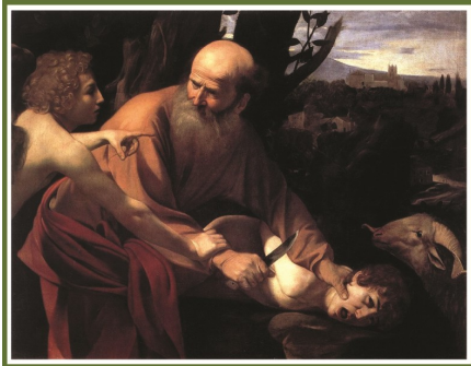
The Sacrifice of Isaac Caravaggio, 1601-02

We are blessed with the example of faith and obedience provided by Abraham. His willingness to sacrifice Isaac was a similitude of Heavenly Father's willingness to sacrifice his Only Begotten Son.