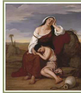
Hagar and Ishmael - Sir Charles Lock Eastlake, 1830

Abraham would be the birthright of Isaac.