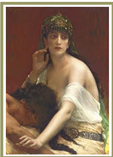
Samson and Delilah Alexandre Cabanal, 1878