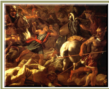
Battle of Gideon Against the Midianites (detail) Nicolas Poussin, 1625-26

Judges 16:1 - He was immoral with a harlot