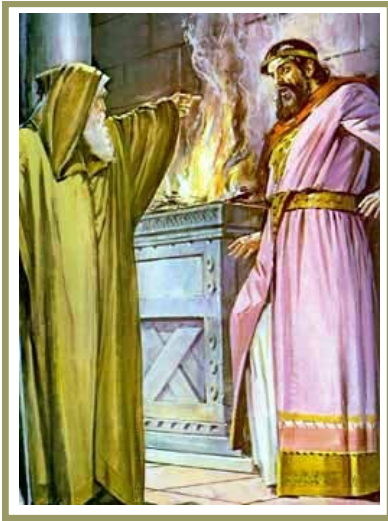
Samuel and Saul

Two years after Saul was anointed king, the Philistines gathered a mighty army to fight against Israel. Saul's men were so afraid that many of them hid and scattered.