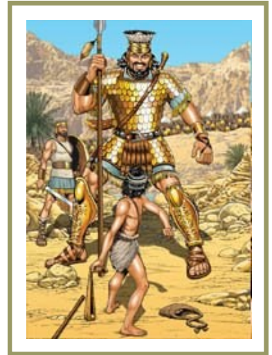
David and Goliath

exposure to their products. You see these materials on all sides. But you need not fear if you have the slingshot of truth in your hands. You have been counseled and taught and advised. You have the stones of virtue and honor and integrity to use against these enemies who would like to conquer you. Insofar as you are concerned, you can hit them 'between the eyes,' to use a figurative expression. You can triumph over them by disciplining yourselves to avoid them. You can say to the whole lot of them as David said to Goliath, 'Thou comest to me with a sword, and with a spear, and with a shield: but I come to thee in the name of the Lord of hosts, the God of the armies of Israel, whom thou hast defied.' Victory will be yours. ... You have His power within you to sustain you. You have the right to ministering angels about you to protect you. Do not let Goliath frighten you. Stand your ground and hold your place, and you will be triumphant" (Ensign, May 1983, 46, 51).