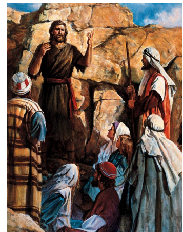
John Preaching in the Wilderness

Luke 4:16-21 Jesus quoted this passage while teaching at a synagogue at the beginning of his ministry to declare that he was the Messiah.