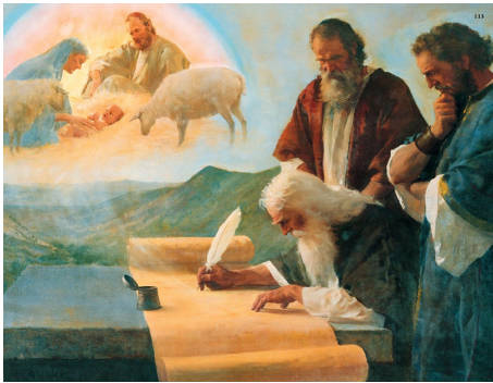
Isaiah Writes of Christ's Birth

Isaiah 61:1-3 prophetically described aspects of the Savior's mission including: